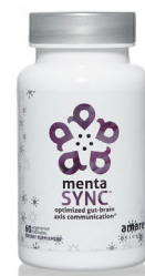
MentaSync for the axis