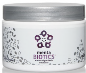
MentaBiotics for the gut