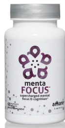
MentaFocus for the brain